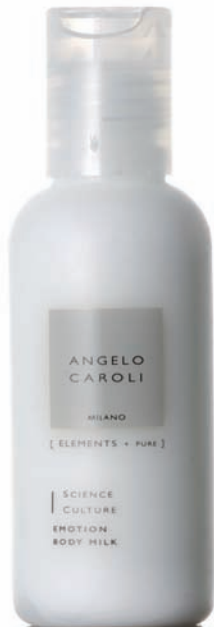
FL68BLC Emotion body milk Healing anti-ageing potion containing rice bran botanicals