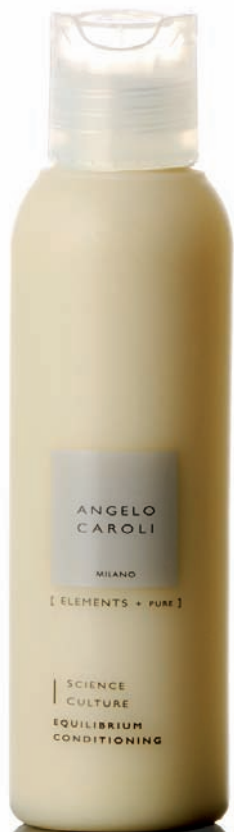
l'm the front