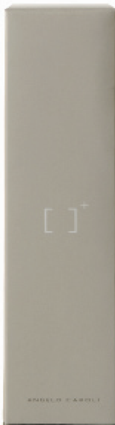
l'm the box