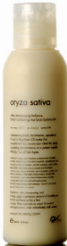
l'm the back