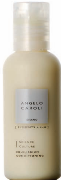
FL68CC Equilibrium conditioning After shampooing balance factor containing rice bran botanicals